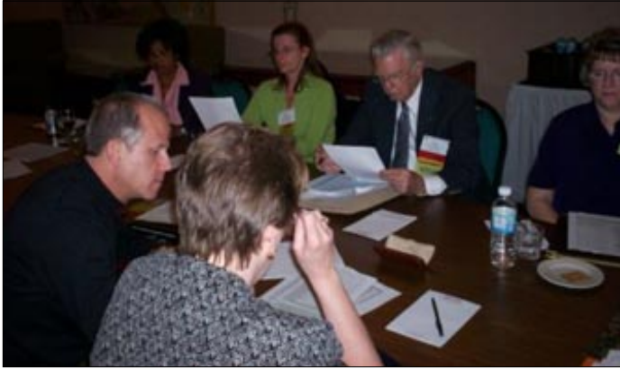
Above, the Annual Meeting of the Gamma Iota Sigma Board of Trustees.