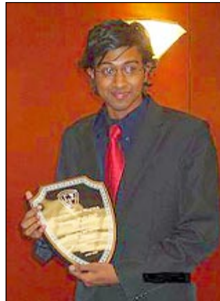
Left, "Super Actuary" by the Alpha Iota Chapter at St. John's University was the Chapter Roll Call Skit winner.