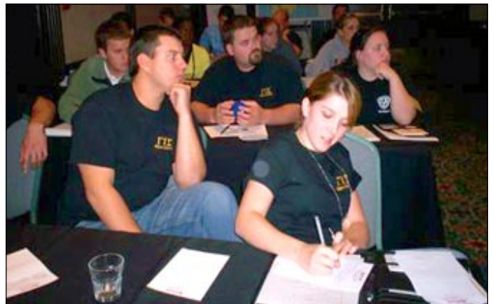
Missed this year's Conference? Start planning now to be at the 2007 International Management Conference hosted by Tau Chapter at Howard University, Washington, D.C., October 11-13, 2007.