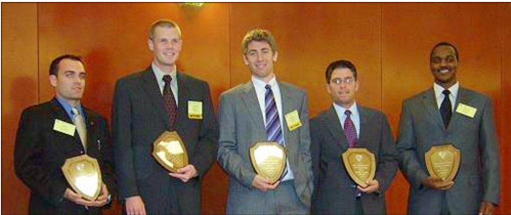
Above: Winners of the Public Relations Award.