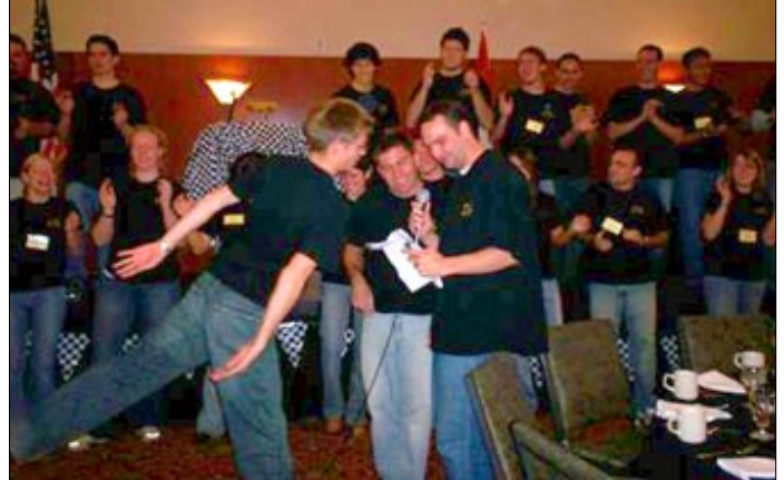
Above, Saturday's Roll Call Skit presented by Sigma, Temple University.